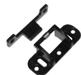
499F 3 5/8" x 1 1/2" x 16/16" (H x W x D)