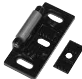
299 7 7/8" x 1 1/4" x 13/16" (H x W x D) Panic device only.