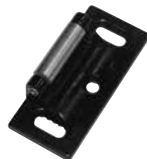
299F 2 7/8" x 1 1/4" x 13/16" (H x W x D)