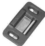
1606 2 7/8" x 1 3/8" x 3/8" (H x W x D) Panic device only.