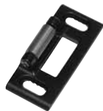
264 2 7/8" x 1 1/4" x 9/16" (H x W x D) Panic device only.