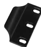
1609 3 1/4" x 1 1/16" x 3/8" (H x W x D) Requires coordinator. Panic device only.